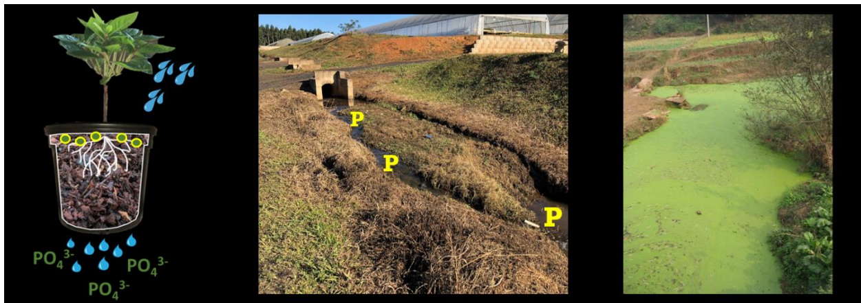
Figure 5. Phosphorus is easily leached from container substrates and causes eutrophication of water resources.

Phosphorus and N contamination are the main algae-promoting nutrients in natural waterways, and a very low concentration (0.1 ppm P) can be enough to trigger eutrophication. Mining P from calcium phosphate in the ground can also cause a significant waste issue, which has been experienced in phosphate mines in Florida, US. As the “green industry”, we want to both stay out of the spotlight and be good stewards of the environment.