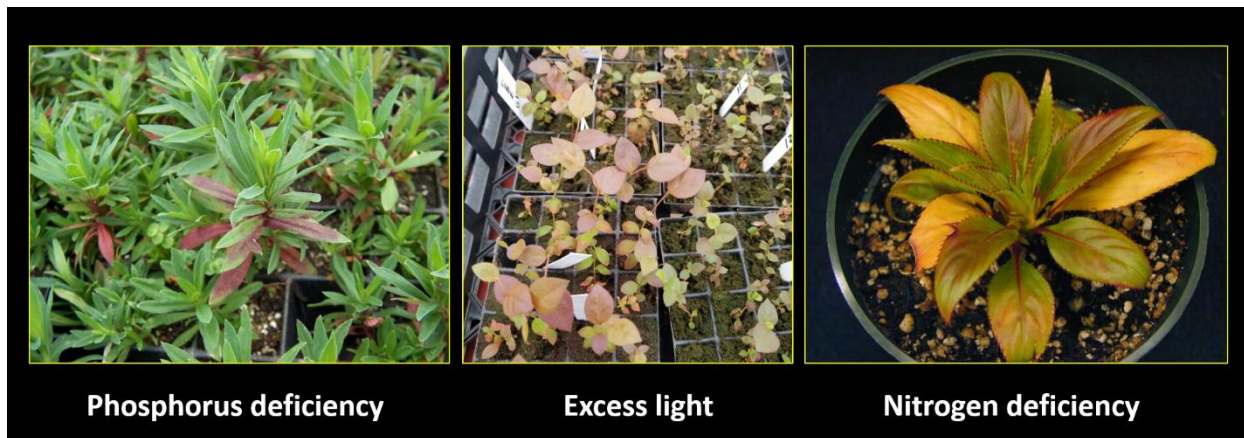
Figure 3. Red or purple coloration can be caused by several factors, not just P deficiency.

Some species show other P deficiency symptoms, such as tip burn in azalea or decreased growth (Figure 4). To confirm a P deficiency, it is therefore necessary to send soil and leaf tissue samples to an analytical laboratory.