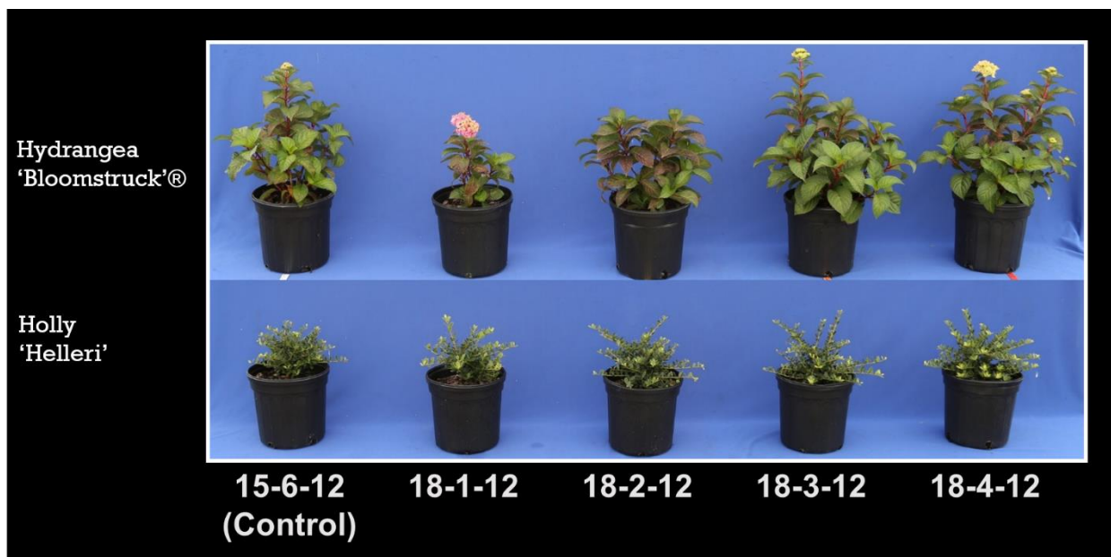
Figure 6. Growth and flowering response of hydrangea and holly to several CRF products. Research by Virginia Tech University.

Controlled release fertilizer: You may use controlled release fertilizer (CRF) and it is hard to relate these WSF concentrations to your nursery. Research at Virginia Tech found that 0.3 to 0.6 grams P per 1-gallon (3.8L) pot provided maximum growth of holly and hydrangea. To achieve that level of P depends on how much fertilizer you apply to a container and the N–P 2 O 5 –K 2 O ratio. For example, plants grown with 18-3-12 or 18-4-